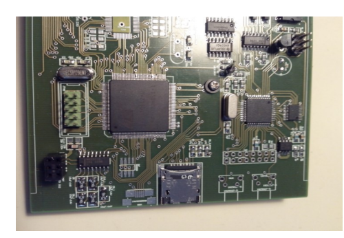
The ARM processor and the microSD card