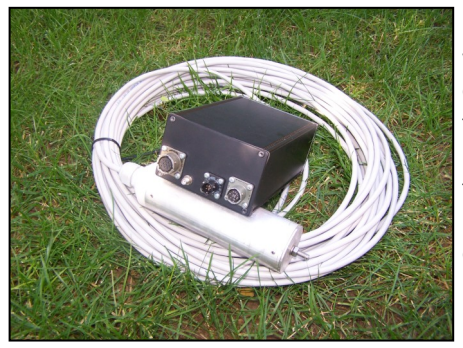
The SRi32L with the C100 sensor

LandTech Geophysics introduces its new ultra high resolution digitizer/recorder which has been designed with the cooperation of GEObit. The technology is based on the SRi32 digitizer/recorder, initially designed for micro-cracking monitoring from the surface. Since Landtech is focusing in both PST and Fracturing Monitoring applications, the instrument has been re-designed, in order to comply with all the requirements for operating in PST acquisition Special characteristics such as ultra high resolution, miniature size, ultra low power consumption (the unit can operate for one week with a small 12V/9Ah battery) combine to make the instrument the most competitive in today's market. Our latest innovation in technology keeps LandTech several steps ahead today's competition.