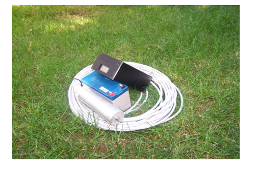
The SRi32L recorder with the C100 passive sensor